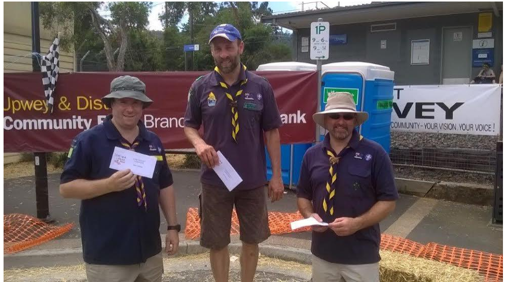
The Leader's Billy Cart race podium!

The culmination of the committee year is the Annual Reports and Awards Night. This year it will be held at the hall on Wednesday 20 th May from 7pm. All youth members and their families are invited. You'll hear about what each section has been up to, see awards presented to various youth members and hear about the