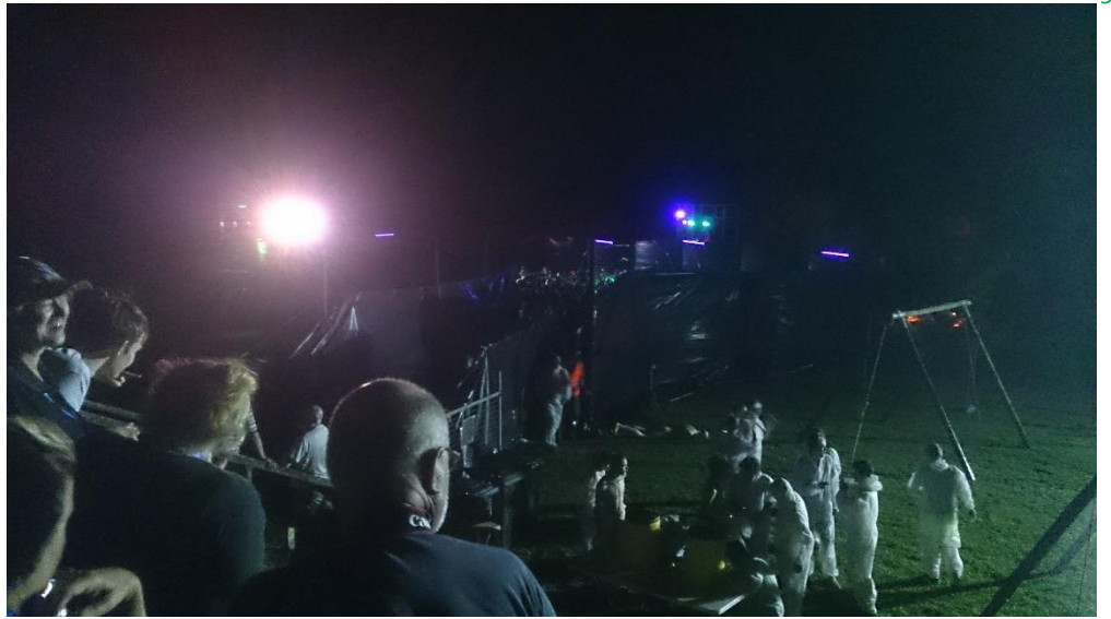
Paint Party wash down!

During the music and light show, fluorescent paint was squirted into the dance arena to the delight of the many hundreds of Venturers. The idea was taken from