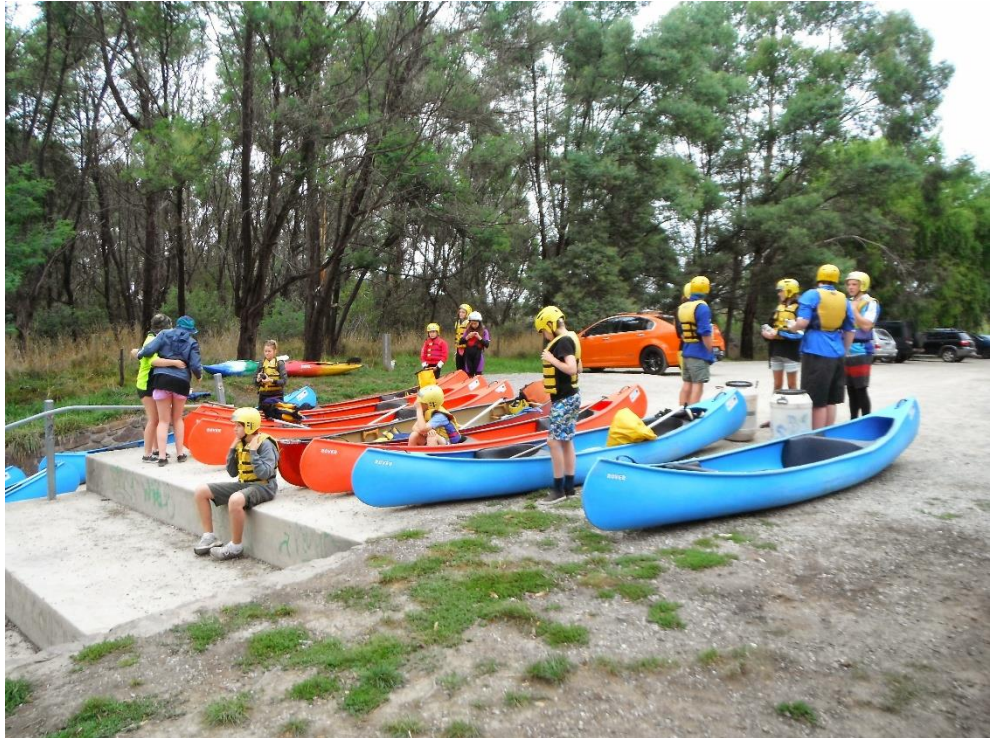
Getting ready on Day 2