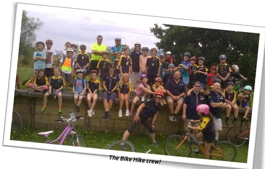
The Bike Hike crew!